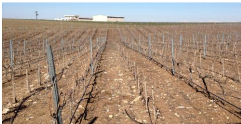
Figure 1. Experimental Farm Vinyard.

This study was carried out in the Agricultural Machinery Department, Agriculture Faculty, Dicle University, Diyarbakir, Turkey. Eight wine grapes varieties, namely Tannat, Merlot, Cot, Chardonnay, Viognier, Cabernet Sauvignon, Shiraz and Cabernet Franc were selected for cutting properties in the experiment. For doing cutting test, sample of grape branches were obtained from Mezopotamia (commercial farm) Vinyard in Diyarbakir Province (Figure 1). The experiment tests were performed during grape pruning season in 2012 year.